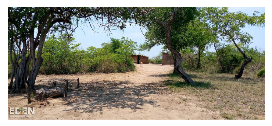
Photo 1: A part of the local community that relies on the river estuary system.